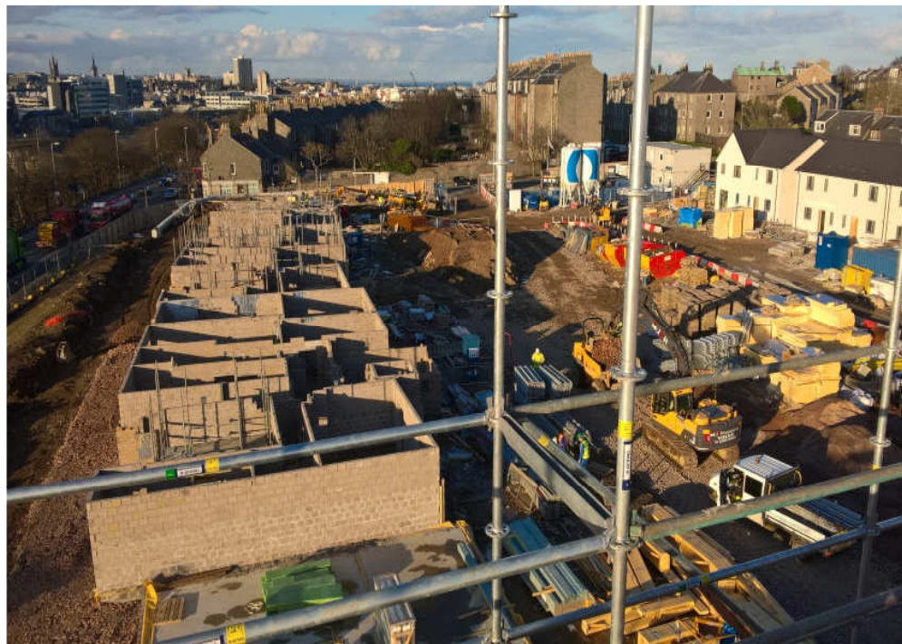
SSHA CRAIGINCHES – INSTALLATION PRODUCT