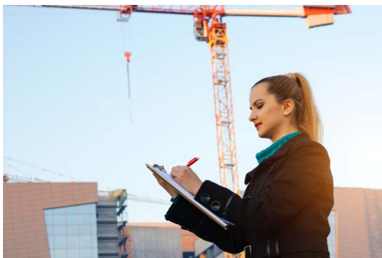
Visitor signing in

Maintaining a record of all visitors, if this is practical.