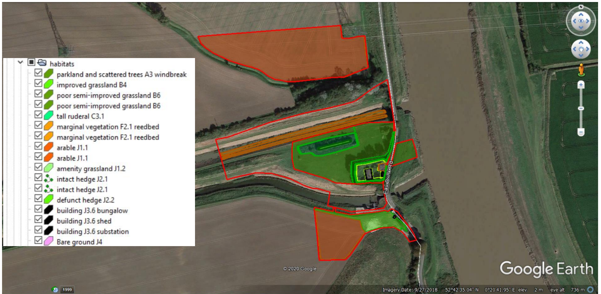
Screenshot 2: Showing the habitats mapped within the site footprint