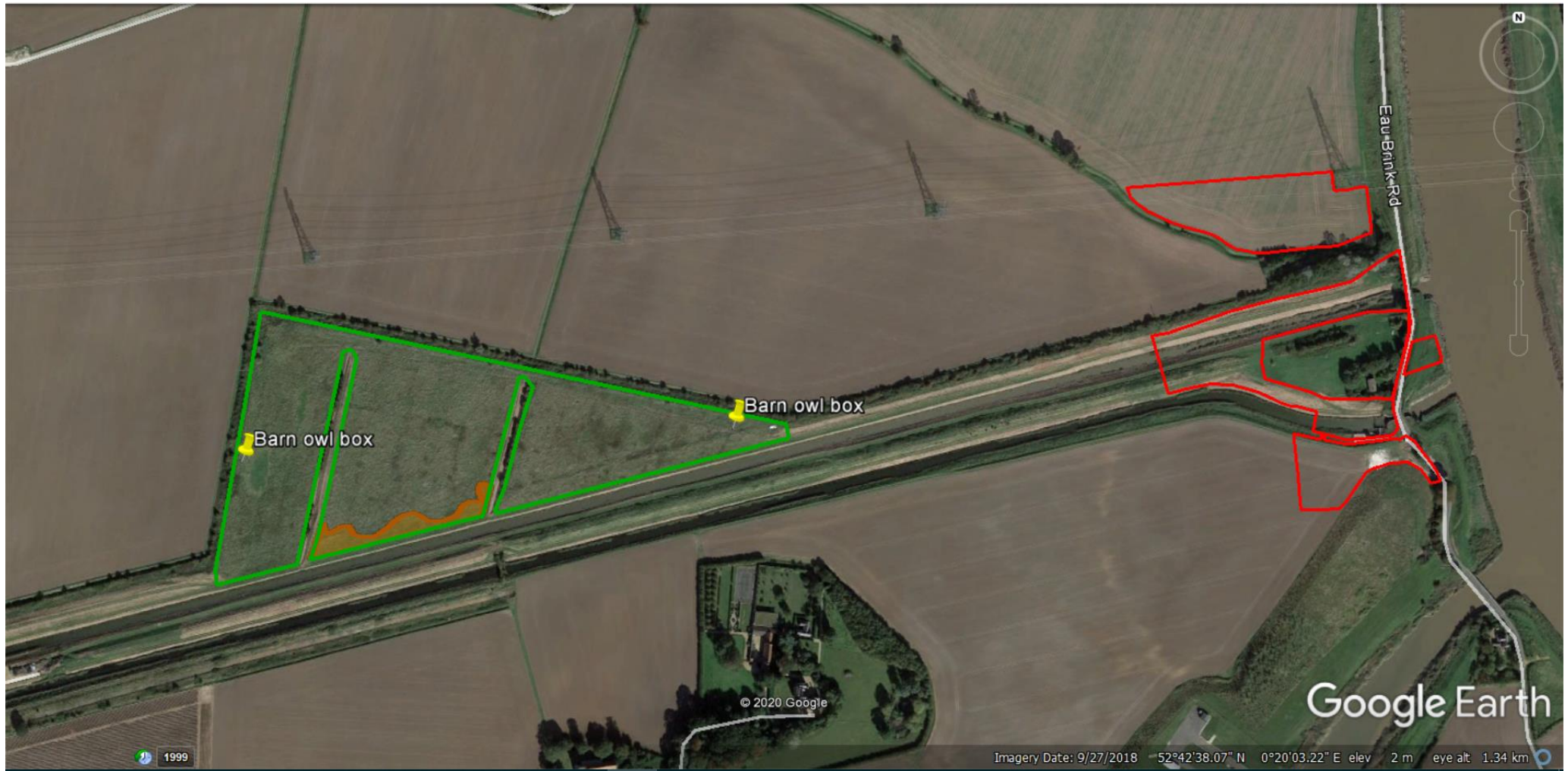
Screenshot 4: Showing the planned area of BNG in relation to the site – the green area is the proposed grassland enhancement, the orange area is the proposed reedbed creation