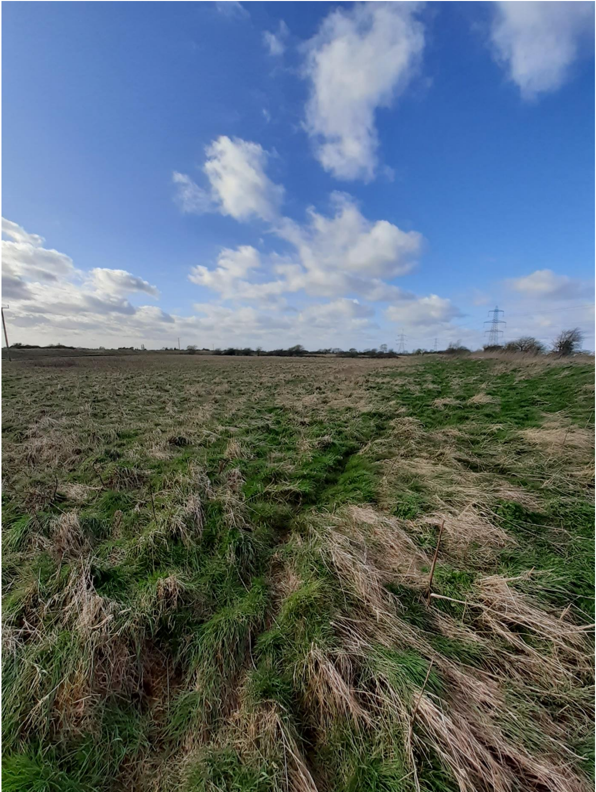
Photograph 3: Showing the overflow area of rough grassland which is proposed to be enhanced in our BNG proposal