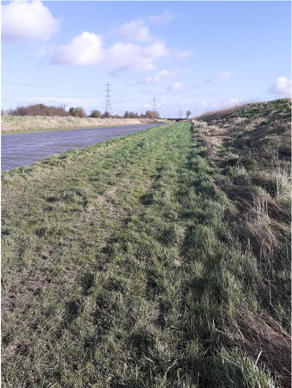
Photograph 2: Showing the County Wildlife Site alongside the Straight Mile, the eastern most stretch of Smeeth Load