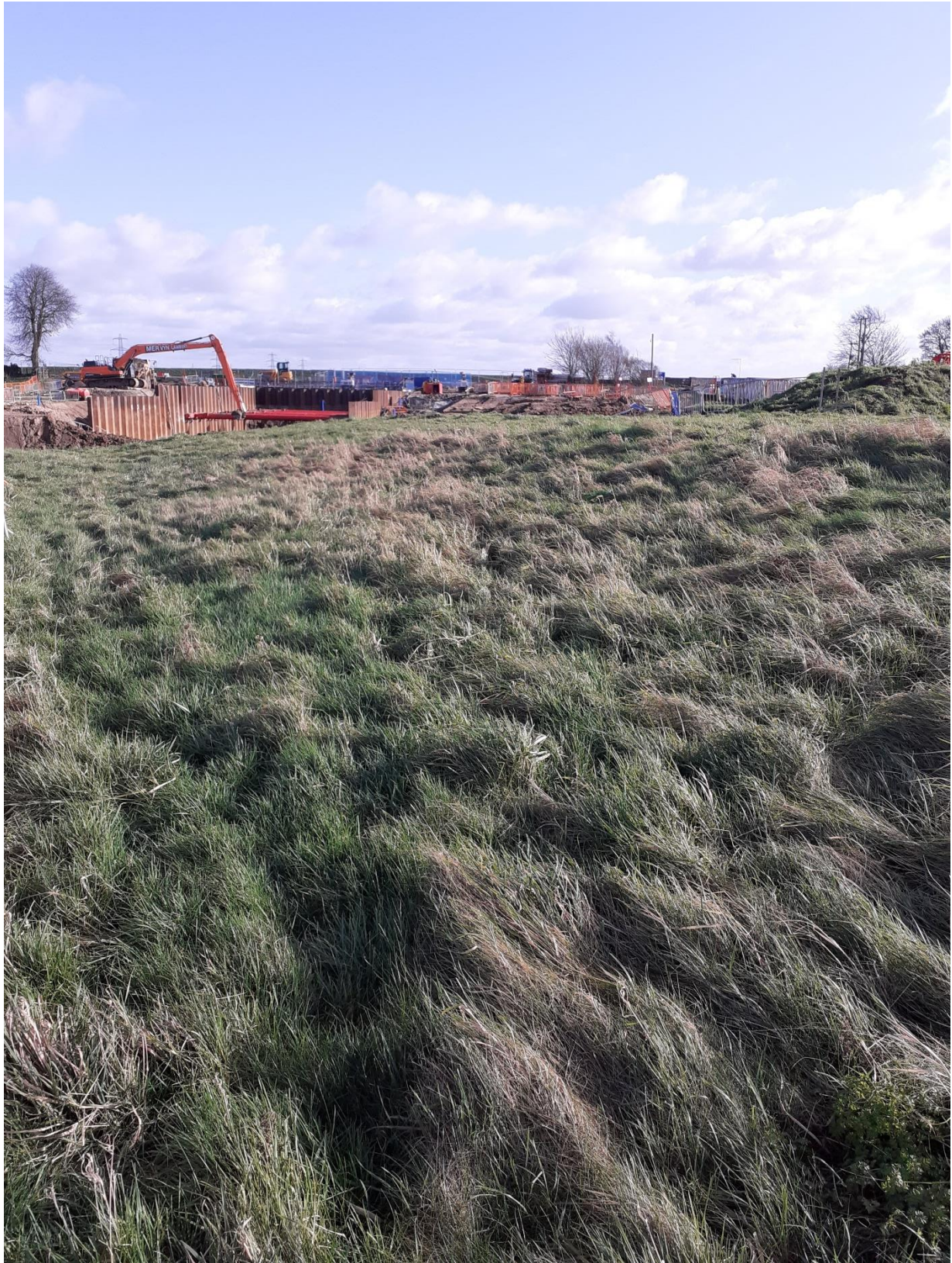
Photograph 1: Showing the site with the County Wildlife Site, North of Wiggshall, grassland in the foreground