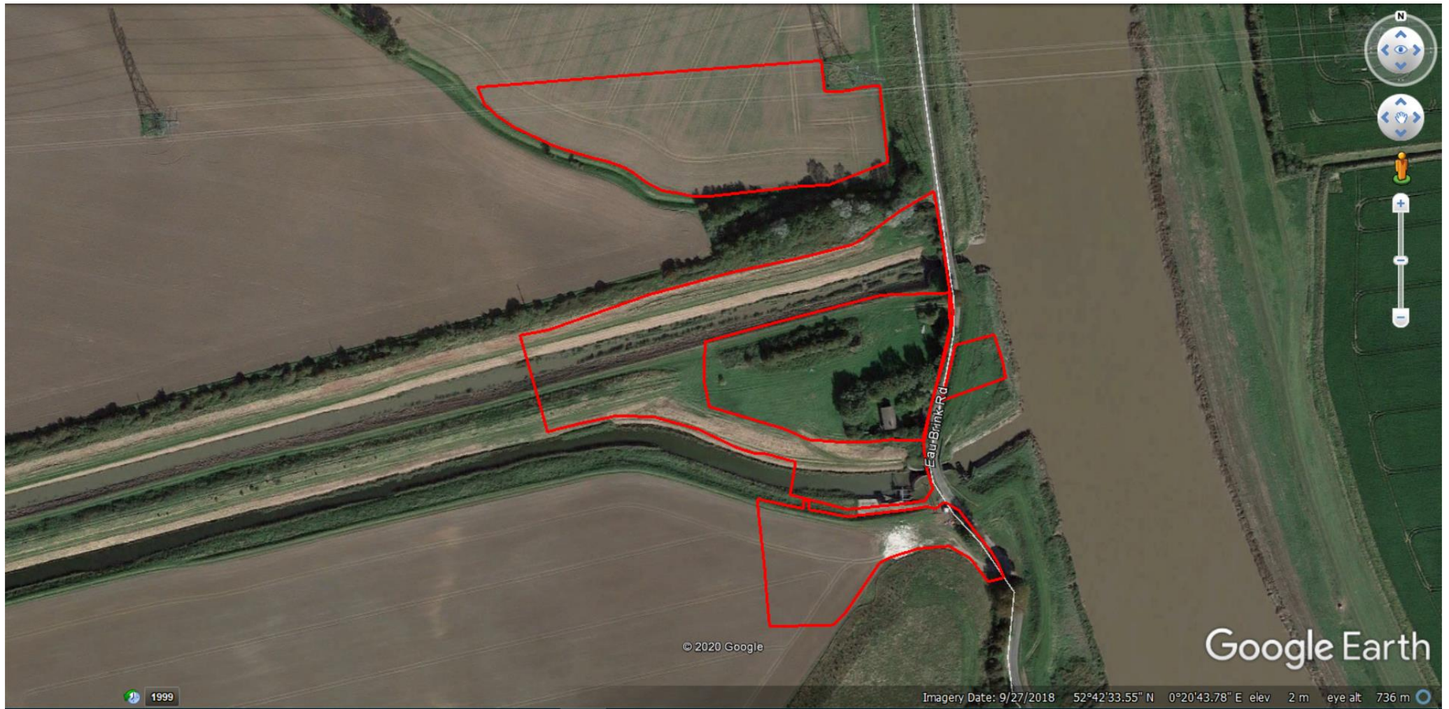
Screenshot 1: Showing the works footprint mapped onto Google Earth Pro©