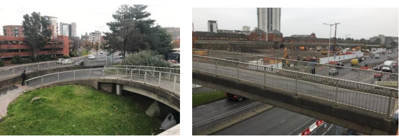
Structures to be demolished

been closed in preparation for it to be demolished, buildings due to be demolished were pointed out so that photographs could be taken to provide before and after scenes for their report. Photographs below show the bridge and one of the buildings that will be demolished.